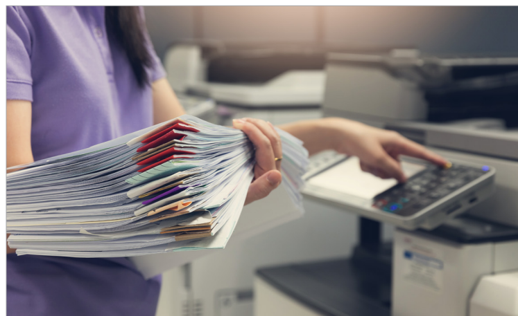
Quantum ECS enables organizations to manage paper and digital content throughout the healthcare enterprise with IDC.

To meet CentraCare's workflow needs, the Quest team configured the batch class to be able to recognize the document type by the header on the EMR's printed sheets, rather than the barcode. Sample documents were provided to train the system so documents could be indexed based on the document type. Batches with 70 pages or more were initially tested. If the system identifies a potential indexing error, it is presented to the user to correct as needed. Once all documents within the batch are indexed and validated, the entire batch exports to the appropriate patient record in Quantum Enterprise Content Solutions.