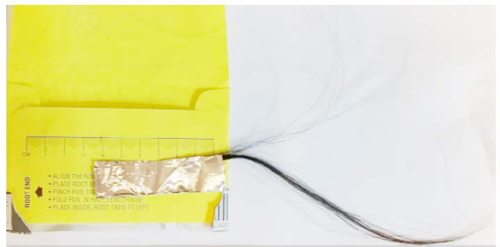
4. In this collection there is no slanted foil and the roots are not aligned. Additionally, there are only 20 to 25 strands of hair instead of the required 100 strands.