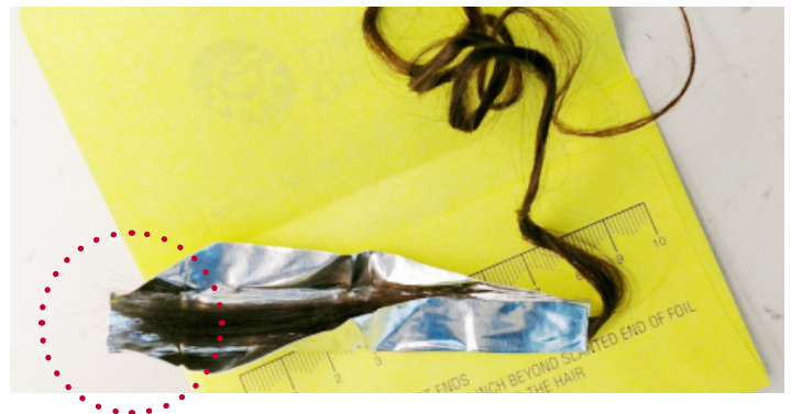
2. The root ends do not extend one-fourth of an inch beyond the slanted end of the foil. Although not a “fatal flaw” collection, it may affect overall turnaround time due to additional work needed to process the specimen.