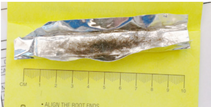
1. This collection does not have all the root ends facing the slanted end of the foil and resembles a “hair brush” collection or something similar.