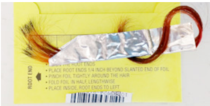
3. The root ends in this collection are not aligned